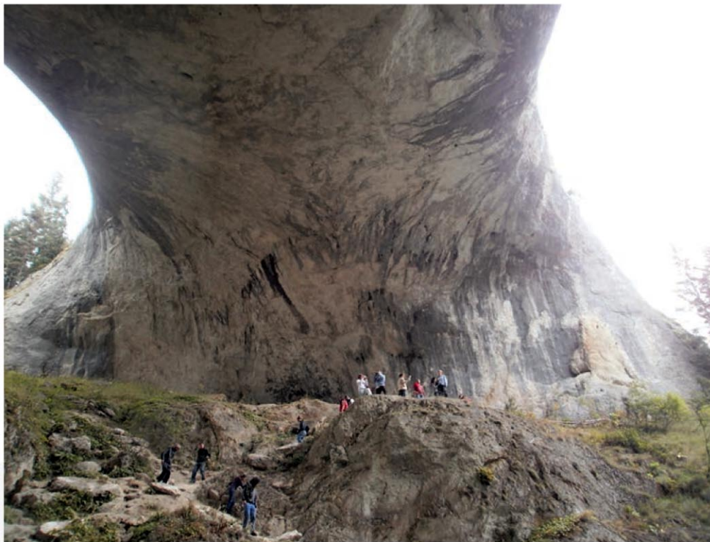
West Rhodopes, Bulgaria